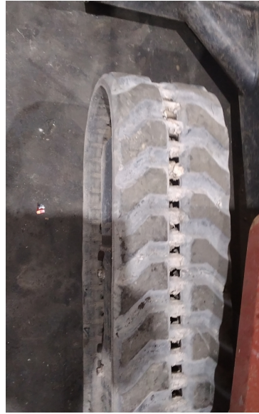
Tyre Condition 1