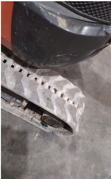
Tyre Condition 2