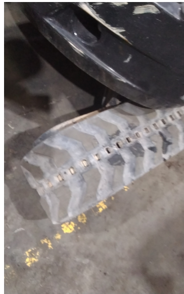
Tyre Condition 3